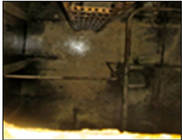
A cleaned and sanitized sewage tank.