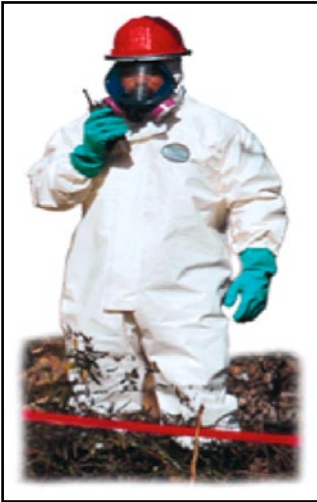
A worker with protective gear.

Note: Respirator shown here is not equipped with organic vapor HEPA cartridge as recommended.